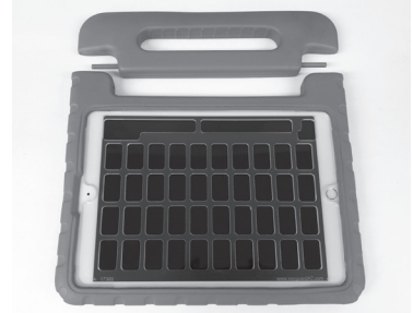
Classic EVA case with handle removed for seating lock-in attachment.

Foam Cases - The snap-in attachment is the only one we recommend for a foam case like the Foam Tech, Big Grips, or the Classic EVA. Slip the tabs under one end of the opening, then bend the keyguard up in the middle and slide the other end into place. Knead the edges of the foam to eliminate any curling-under until they rest completely on top of the tabs and the keyguard lies flat. (Lock-in: We don't recommend the lock-in attachment for these cases, because they are extremely difficult to install, but if you ordered one, it's better to start at one corner and work your way around to the other corners. If your case has a folding handle, remove it for easier access. Start with the stiffest corner, and end with the flimsiest corner. If you put a lock-in attachment in this kind of case, you'll never want to remove it so you never have to do it again.)