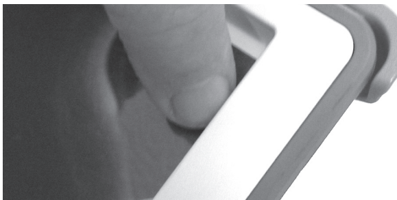
Breaking the seal on an Otterbox Defender

Snap-together Cases - If your case is a snap-together clamshell type like the Otterbox Defender or has a plastic bezel like the Gumdrops Hideaway, open the case. If there is a clear screen protector, break the seal on the ends where the tabs will be inserted by pressing your fingertips against the edge. It's usually just secured with double-sided tape or light glue, so it's easy to separate, and you'll hear a slight cracking sound as the glue is separated from the frame. If the screen protector is held with a really strong glue that you cannot break, you can cut it along the edge of the frame bezel with a sharp knife. Be sure to cut it exactly even with the bezel, or the keyguard won't fit. You can leave the two longer edges of the screen protector glued in place. Reassemble the case with the iPad in it. It's usually a tight fit the first time.